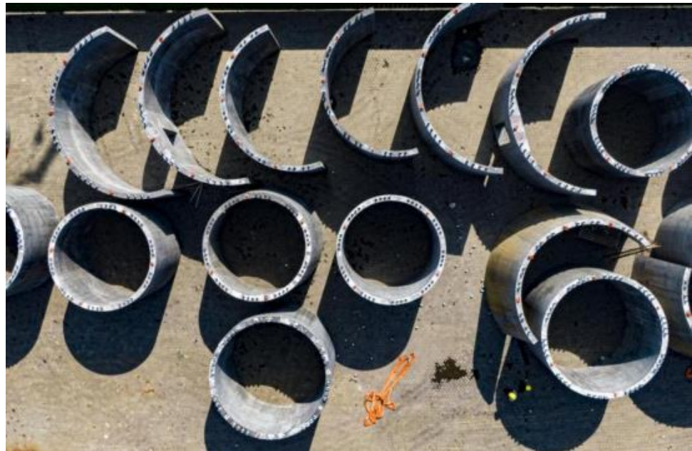
Figure 3 Prefabricated segment of the concrete tower