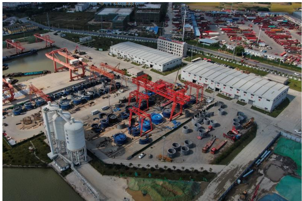
Figure 4 Prefabrication yard of the concrete tower tube

The project adopts an internal prestressed system. Through grouting material, the steel strand is integrated with the tower tube, separating the steel strand from the corrosive environment outside, so that it can still maintain good performance in harsh natural environments and improve the durability of the steel strand. In addition, the bonded prestress can enhance the integrity of the prestressed tendon and the structure, ensure that the prestress loss is controllable, and greatly improve the safety of the tower tube.