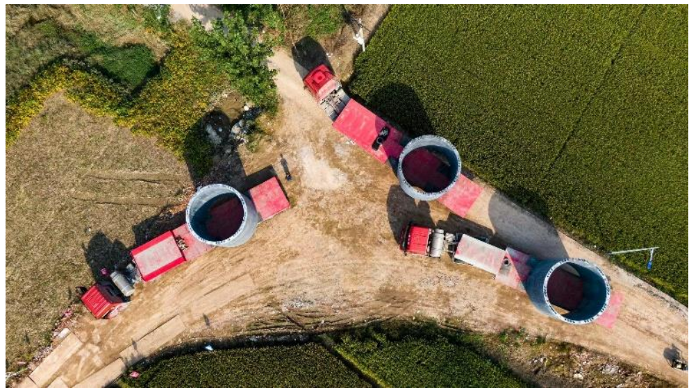
Figure 2 Transportation of 180 m wind turbine mixed tower components in Lianshui, Jiangsu

The mixed tower section adopts a standard modular tube section design. Through the flexible combination of 9 standard tube section modules, it can adapt to different tower schemes with different main wind turbines and different heights from 120 m to 300 m.