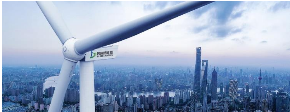
Figure 1 Wind turbine concept map

wind resources in the environment of low wind speeds and high shears, and improve the overall power generation efficiency.