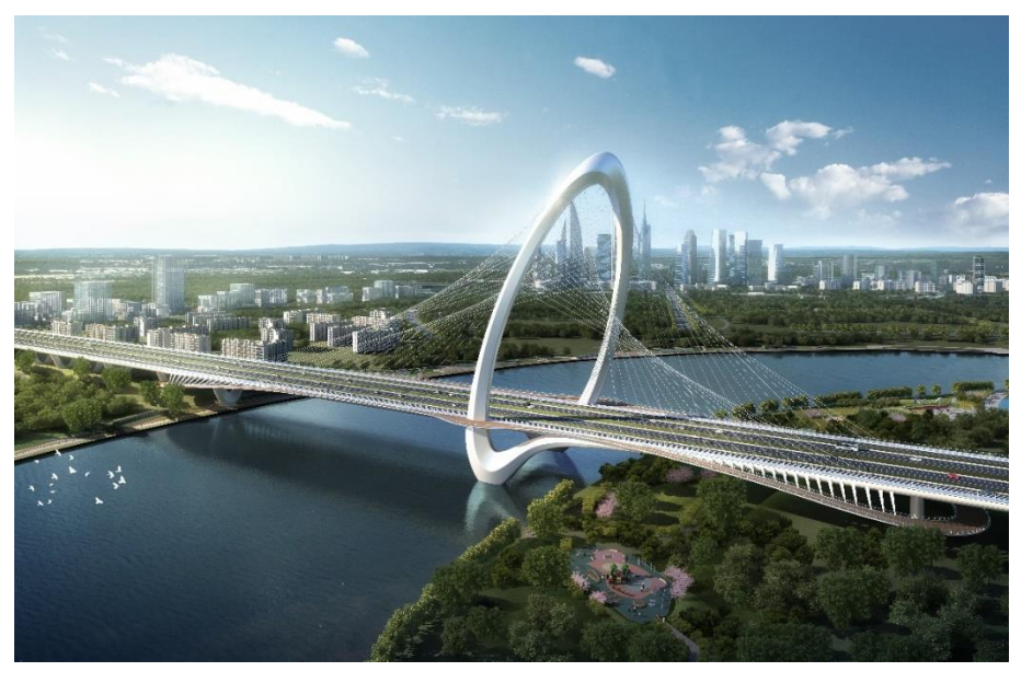
Figure 1. Rending perspective view of Tuojiang Bridge

Citation: Wu, Y. The Largest Space-Asymmetric-Curved-Single Tower Twisted-Cable-Plane Cable-Stayed Bridge— Tuojiang Bridge of Jinjianren Expressway Phase II. Prestress Technology 2023, 1 , 89-92. https://doi.org/10.59238/j.pt.2 023.01.008